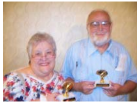
1 st Overall