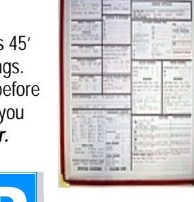
Daily Hospitality Free Coffee & Complimentary Parking

Let us know you're here! The Registration desk opens 45' before each session mornings, afternoons, and evenings. It's located in the main hallway. It closes 15 minutes before event to allow volunteers to get to their tables. When you register, pick up your gift of a convention card holder.