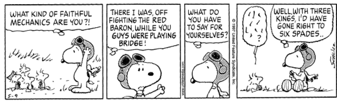
Copyright 3 1997 United Feature Syndicate, Inc Redistribution in whole or in part prohibited

In May 1997 four consecutive strips featured bridge hands, and the American Contract Bridge League made Snoopy and Woodstock honorary life masters. Here is the first of four strips: